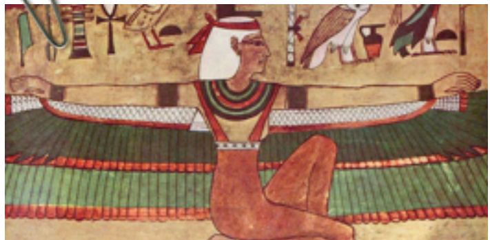
The Egyptian goddess Isis fell into disfavor with the first Roman emperor, Augustus