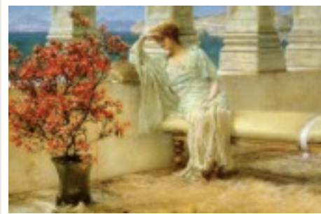
by Sir Lawrence Alma-Tadema

“Selene’s life is a lesson to us that the trajectory of women’s equality hasn’t always been a forward march. In some ways the ancients were more advanced than we are today; there have been setbacks before and may be more in the future.”