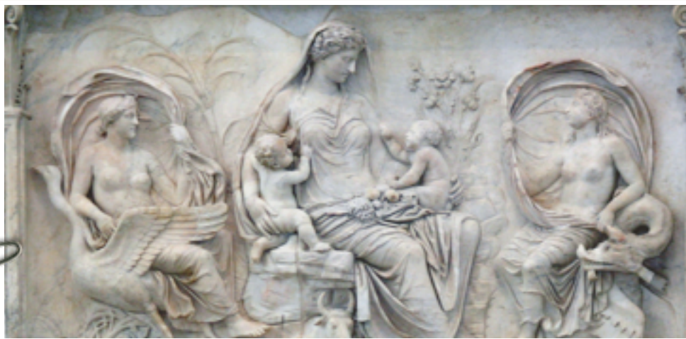
The famous "Tellus Panel" on the Ara Pacis: the mysterious goddess and her winds