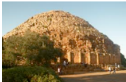
The remains of Cleopatra Selene's tomb